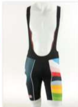
Men's Bicycling Stripe Bib Shorts Bicycling $200.00