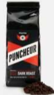
Bicycling Puncheur Organic Whole Coffee Beans Bicycling $16.00