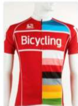
Men's Bicycling Stripe Jersey Bicycling $100.00