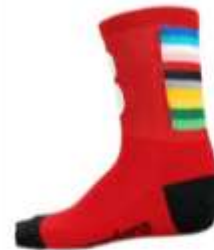
Bicycling Stripe Socks Bicycling $14.00